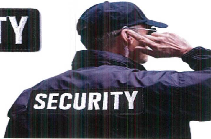
VELCRO – Security Logo